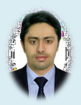
VISA STATUS: Employment Visa